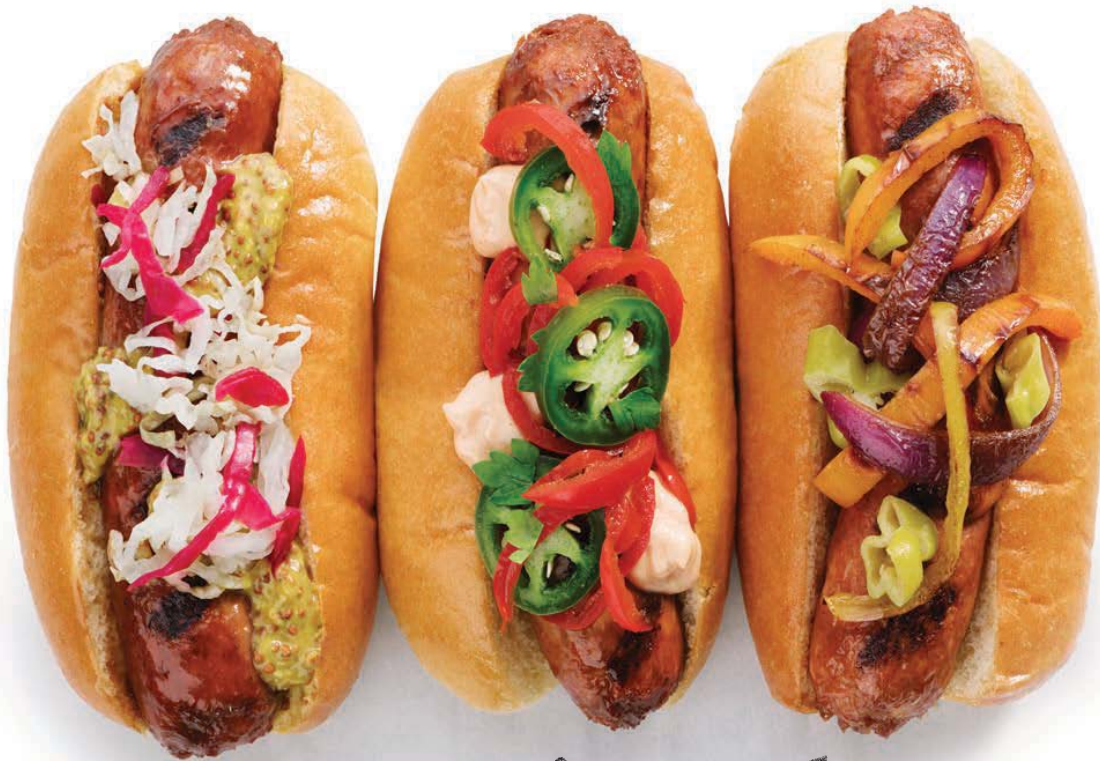
↖ Brat Original

THE WORLD'S FIRST PLANT-BASED SAUSAGE THAT LOOKS, SIZZLES, AND SATISFIES LIKE PORK.